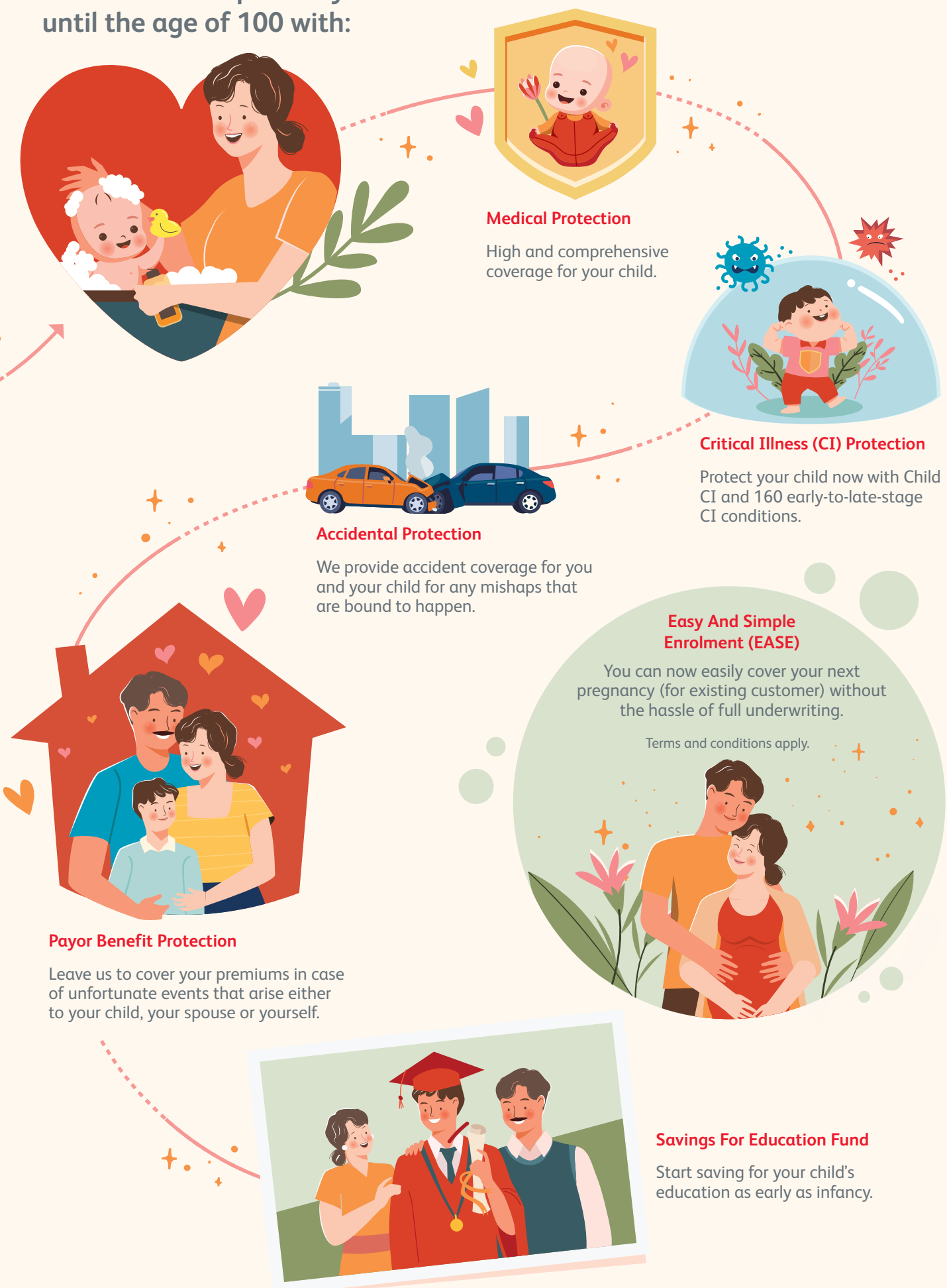
Mom and Baby Care - Table of Benefits